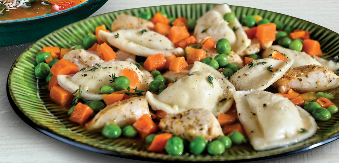
Chicken and Pierogy Dumplings