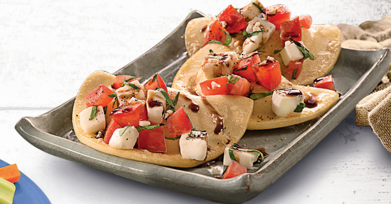
Garden Fresh Pierogy Bruschetta