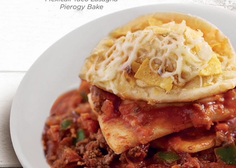
Mexicali Taco Lasagna Pierogy Bake