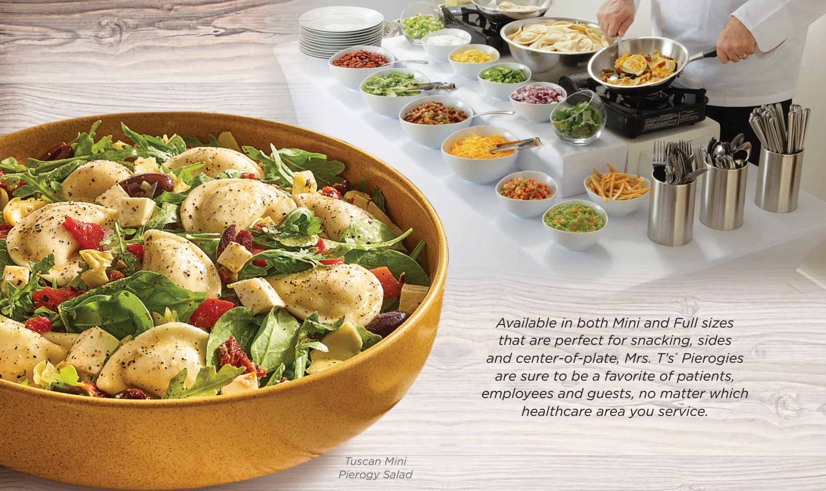
Tuscan Mini Pierogy Salad

Available in both Mini and Full sizes that are perfect for snacking, sides and center-of-plate, Mrs. T's® Pierogies are sure to be a favorite of patients, employees and guests, no matter which healthcare area you service.