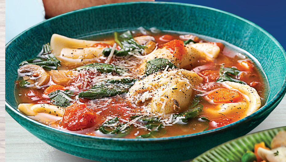
Tuscan Garden Pierogy Soup