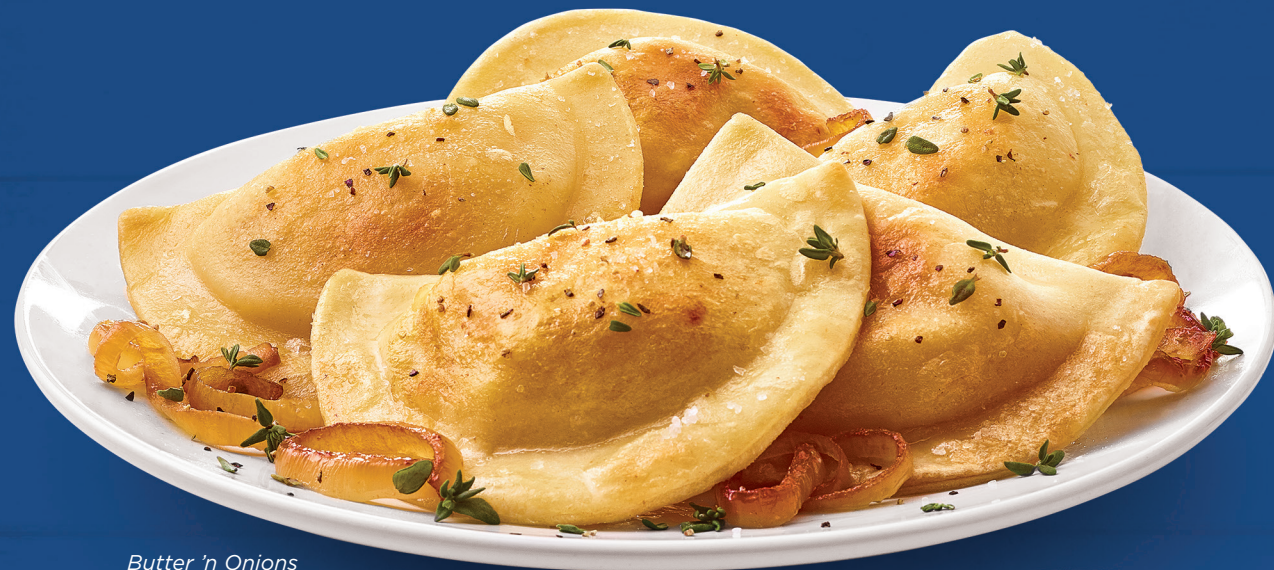
Butter 'n Onions

As a savory, satisfying combination of pasta, creamy whipped potatoes, hearty cheeses and other premium ingredients, Mrs. T's® Pierogies are the deliciously simple, easily prepared comfort food that's right for every healthcare menu, recipe, and palate.