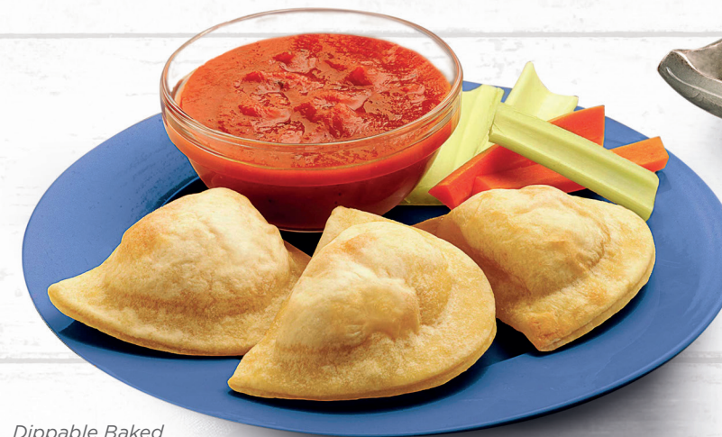
Dippable Baked Pierogies