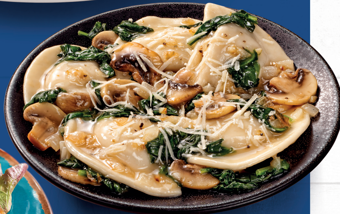
Baby Spinach & Mushroom Pierogies